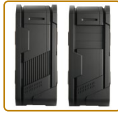
EZASY (EZ) slide door for embellishing the drive bays