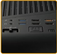
Full scale I/O with Super Charge port and a fan controller