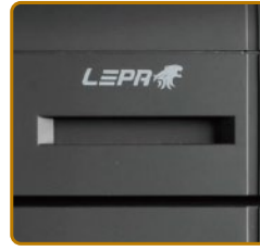
2.5" drive hot swap dock