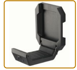
Removable Magnetic Headset Holder