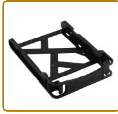
2.5" / 3.5" compatible drive tray