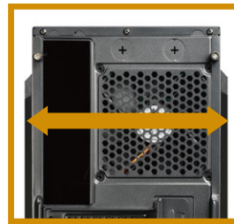
Extruded side panels creates ample space