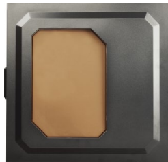
With acrylic window