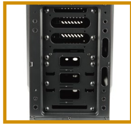
Two front fan slots for super cooling