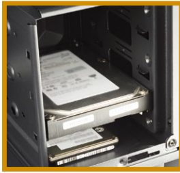
One extra 2.5" HDD space at bottom