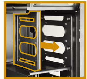
Removable 2.5" bracket to fit longer VGA card