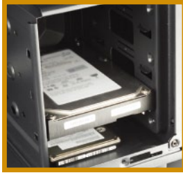
One extra 2.5" SSD space at bottom