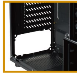
Bottom mounted PSU slot