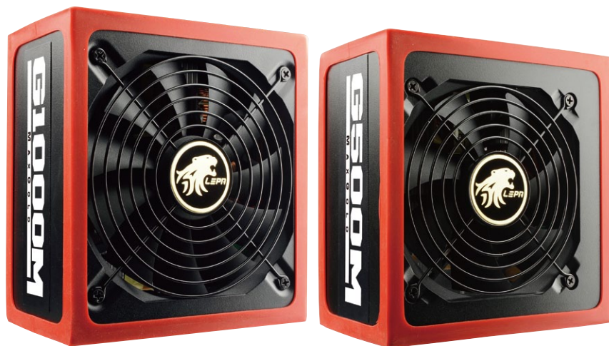
700W / 800W / 1000W 165(L)x150(W)x86(H) mm