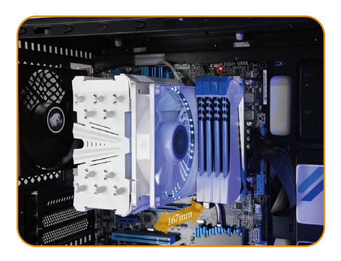
Supports CPU cooler up to 167mm in height

Quick-release ODD bay covers and HDD trays for easy installation.