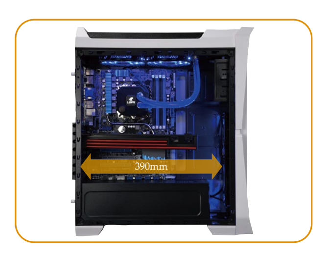
Supports the latest long VGA card (390mm Max.)