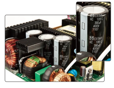
Solid State Capacitors and 105°C Japanese Grade A Capacitors