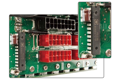
Over Power, Over Voltage, Under Voltage, Over Current, Over Temperature, Short-circuit protection