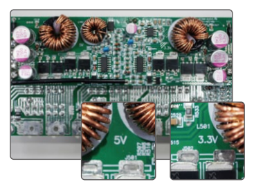
DC-to-DC Converter Design